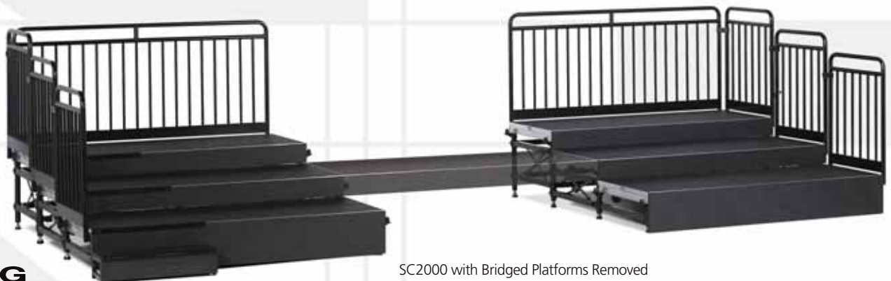
SC2000 with Bridged Platforms Removed