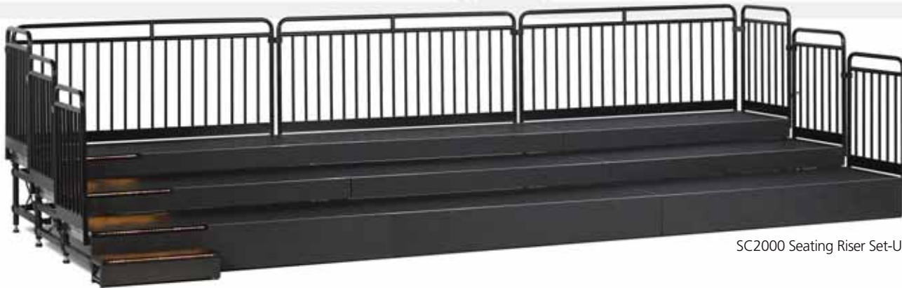
SC2000 Seating Riser Set-Up

The key features of the SC2000 are its quick setup, flexible configurations, and compact storage. The understructure unfolds like an accordion and expands to fill the designated space. Only two people are required for setup and custom sizes are available to fit into even the most unusual spaces. Should you need less or no seating at all, the SC2000 folds into 15% of its expanded size and easily rolls away on retractable casters for storage.