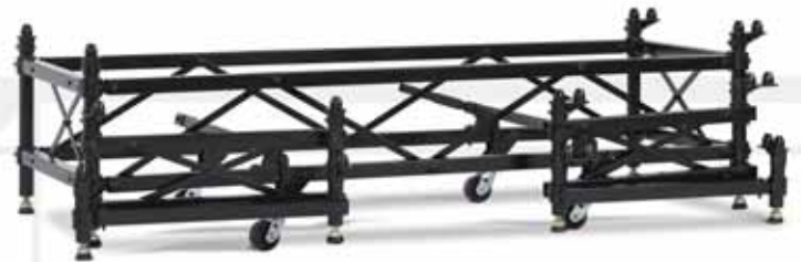
SC2000 Understructure – Folded Position