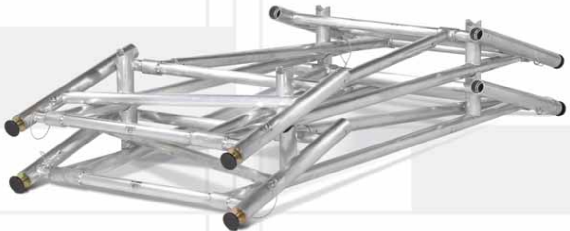
SC9600 Collapsible Bridge Support – Collapsed and Stacked